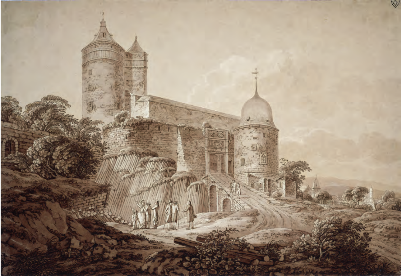
Fig. 4 The Stolpen Castle, viewing a basaltic columnar jointing cliff near its main gate. View to west. Sepia colored outline etching from Adrian Zingg (1734–1816), 44.5 × 30.7 cm, c. 1775.